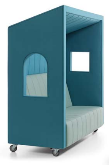
BH version l