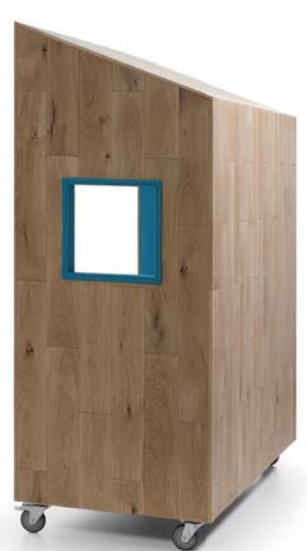
BHW version III